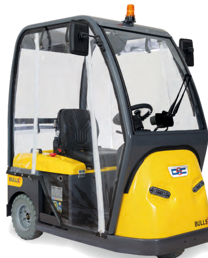
BULL 2-5 N CAB 1