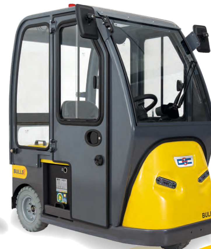
BULL 2-5 N CAB 2